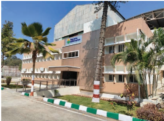
BIMSTEC Centre for Energy Bengaluru, India

Currently, there are two BIMSTEC Centres: the BIMSTEC Centre for Weather and Climate in Noida, India focussed on enhancing scientific capacity in weather & climate research, and the BIMSTEC Energy Centre in Bengaluru, India which coordinates, facilitates, and strengthens cooperation in the energy sector among the member States.