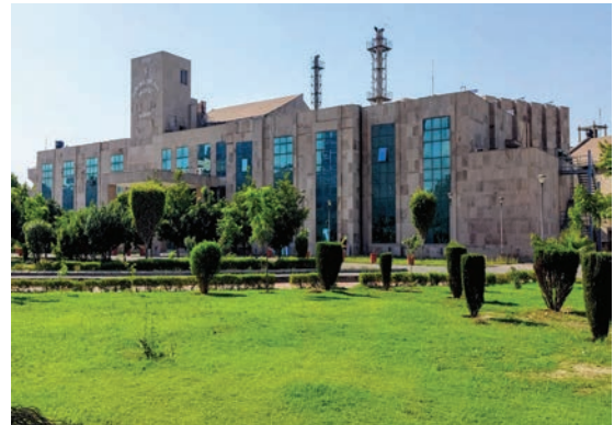
BIMSTEC Centre for Weather and Climate Noida, India